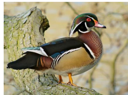
Wood Duck, adult male

If you enjoy feeding the ducks and geese at your local pond or lake, we recommend chopped lettuce, bird seed, cracked corn or seedless grapes cut in half.