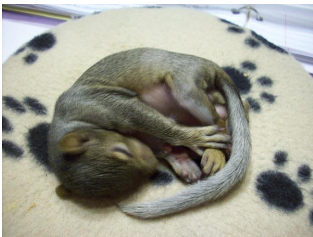
Eastern Gray Squirrel

Our second round of baby mammals is in full swing. We are currently caring for 70+ Virginia Opossums and 20+ Eastern Gray Squirrels with more arriving nearly every day. The very young ones (eyes still closed) require round-the-clock feedings every 2 to 2-1/2 hours, so our mammal team is not getting much sleep these days.