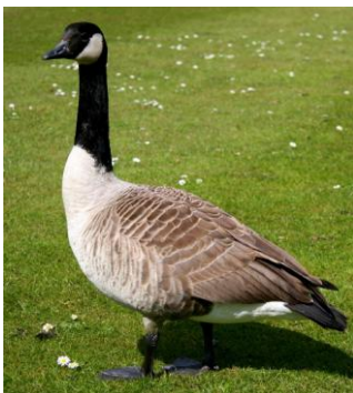
Canada Goose, adult

Geese feed primarily on grasses and insects but may eat the occasional berry. The fact that they eat grass (and have very large poop) is probably a reason they are not very popular on golf courses.