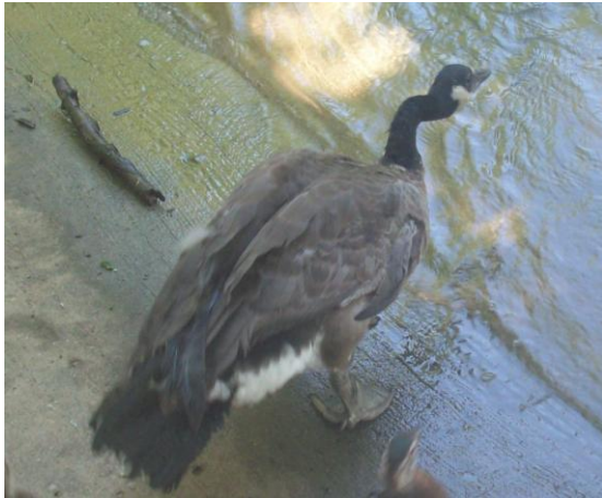
Canada Goose, juvenile

Incorrectly called “Canadian” geese by many people, they are our most common and plentiful goose species. They are easily spotted in flight in a “V” formation. Each goose takes a turn leading the flock in flight as the others coast behind.