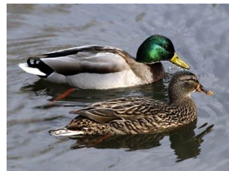
Mallards, adult male and female