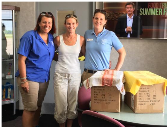
At the end of the flight

The staff from the Columbus Zoo was waiting to receive the birds at the airport at Ohio State University.