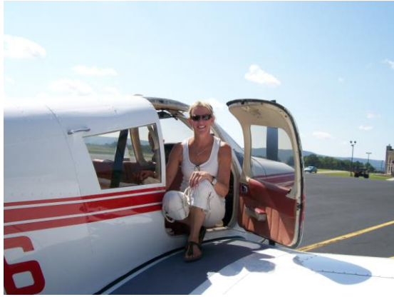
Ready for take-off

On transfer day, the birds were placed in travel boxes with enough food to tide them over for approximately three hour trip.