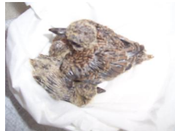
Nestling Mourning Doves

Carolina Wrens, Mourning Doves, and House Finches frequently nest in hanging planters. A great way to solve the dilemma of how to water your plants without disturbing the birds is to place ice cubes around the edge of the basket on top of the soil. The ice will melt slowly, watering your plants without getting the birds or their nest wet.